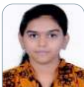
Sushma AP Web Programming