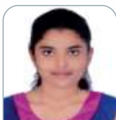
Sharavathi BS Income Tax