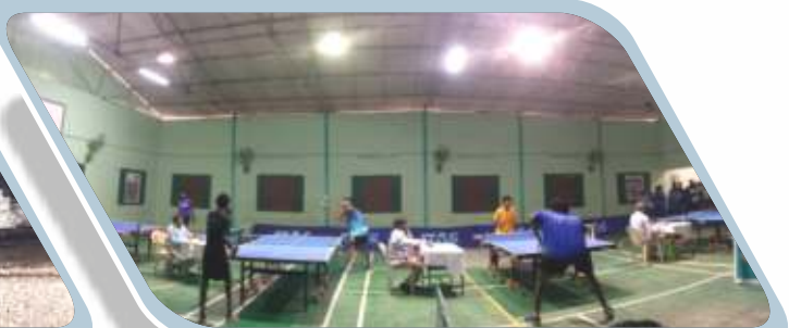
Indoor and Outdoor Sports