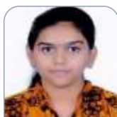
Sushma AP 92.20%