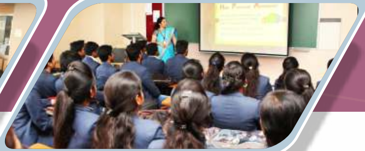
ICT Classrooms with LED PROJECTORS