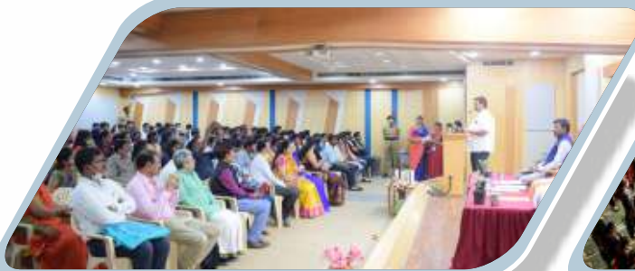
Spacious and ICT enabled A/C SEMINAR HALL