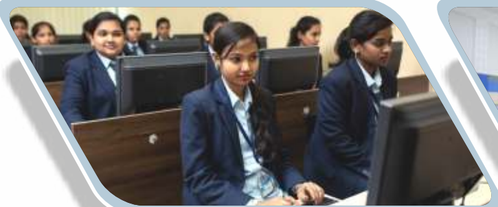
Well Equipped COMPUTER LABORATORY