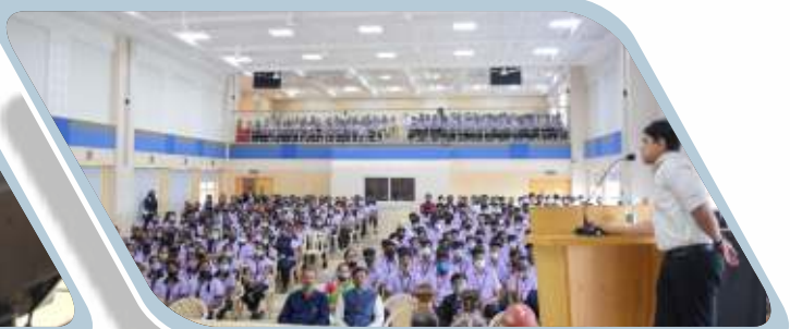
AUDITORIUM with modern acoustics & ICT Facility