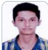
Ramprasad SK Theory of computation