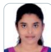
Sharavathi BS 88.71%