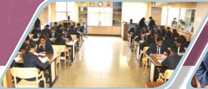
Well stacked library with E-LIBRARY FACILITY