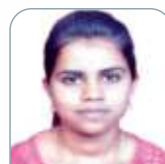
Sharavathi BS 89.30%